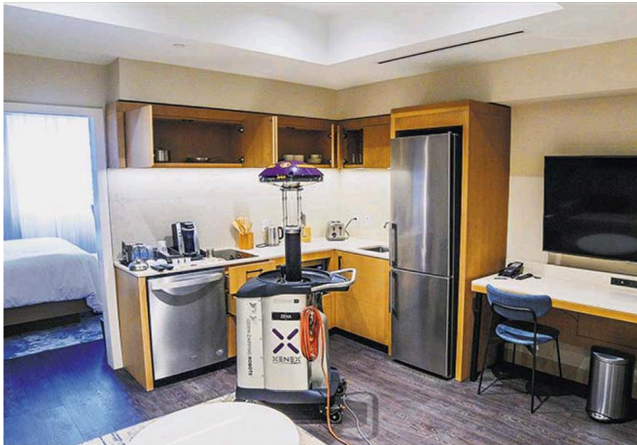
WESTIN HOUSTON MEDICAL CENTER

From top: the Westin Houston Medical Center, which added germ-zapping robots to its housekeeping team; JetSuite; the Cape Arundel Inn & Resort in Kennebunkport, Maine.